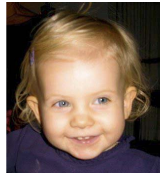
She's a cutie!!!!

Here's a picture of our beautiful Danish granddaughter.